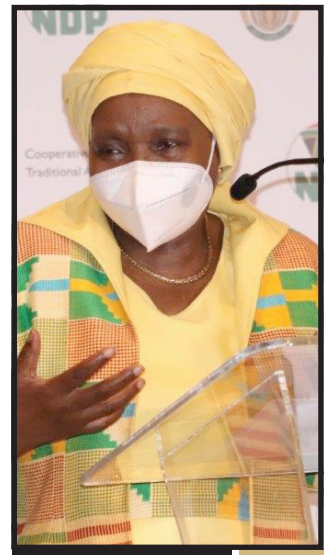
National Minister of Cooperative Governance and Traditional Leaders Nkosazana Dlamini Zuma