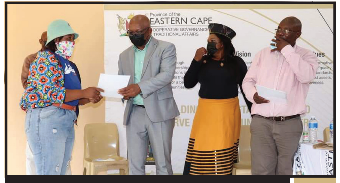
MEC handing over certificate to one of the trainees

Certificates were handed over to ten (10) people who got training in building and civil skills during the construction period.