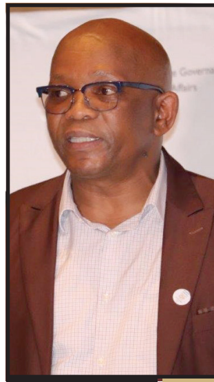
MEC X Nqatha