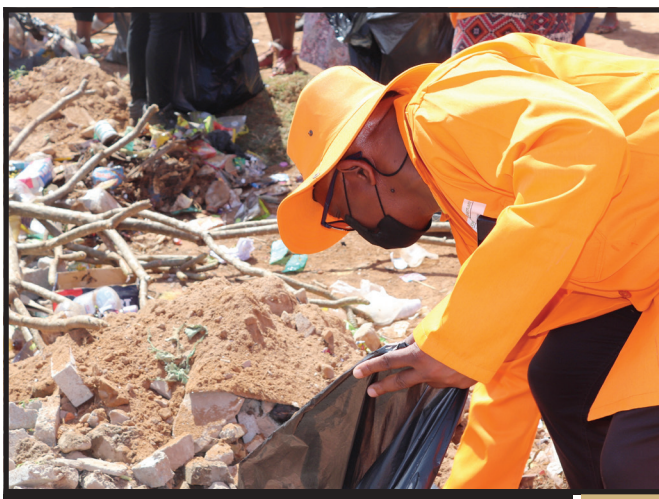
MEC Nqatha leading the cleaning campaign in Hankey