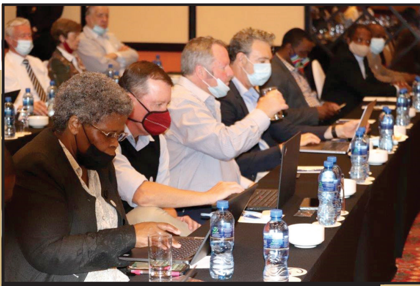
Business Stakeholders at Wild Coast