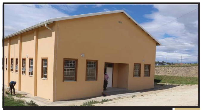
Newly built Nothenqa Hall