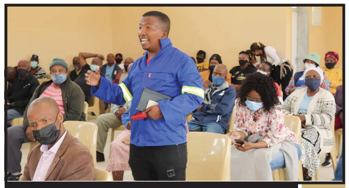
One of the villagers speaking at the handover event