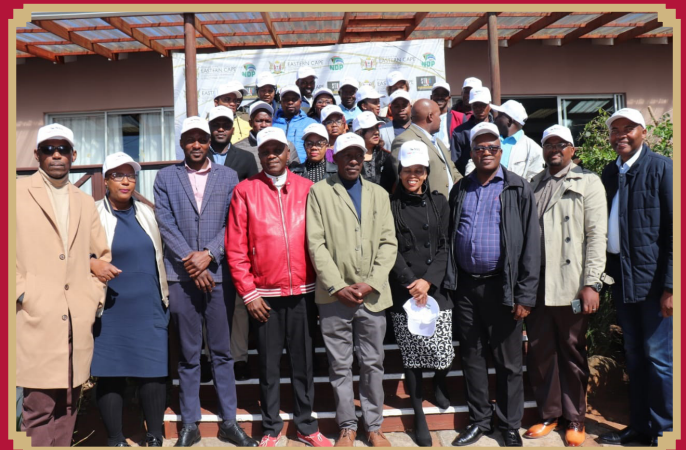
Traditional leaders of the Eastern Cape