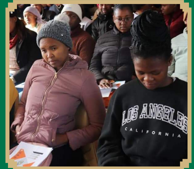
Attendees of the youth expo

During the expo, various companies and departments which promote entrepreneurship highlighted opportunities available for young people. The leading educational institutions in the Province offered advice and study opportunities to the attendees.