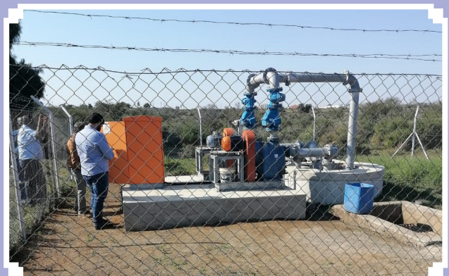
Borehole in Dr Beyers Naude LM