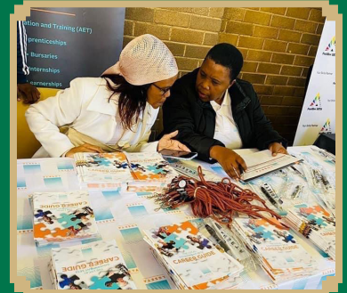
Exhibition stalls at the youth expo